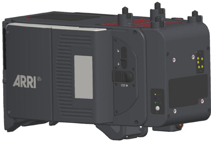
1. Back of camera showing mounting threads