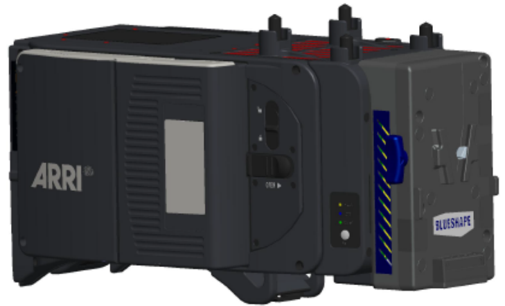
4. V-plate mounted on adapter body